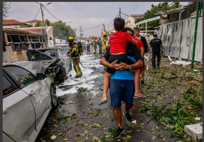
A rocket is fired from the Gaza Strip by Palestinian militants hit a building and cars in the southern Israeli city of Ashkelon. October 9, 2023.

KKL-JNF is in direct contact with the relevant authorities in the western Negev and receiving ongoing updates about their immediate needs. Funds will be transferred for these purposes as required.