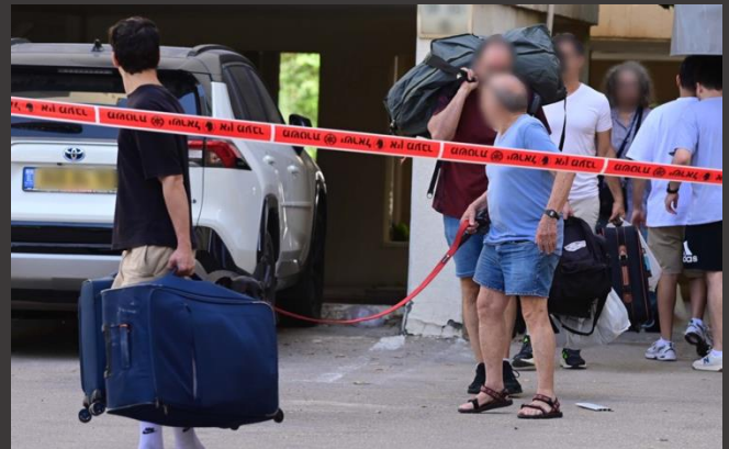
Residents living in a building which got a direct hit by a missile fired from Gaza, in North Tel Aviv, seen being evacuated on October 7, 2023. Militants from Gaza sent a barrage of rockets into central and southern Israel this morning.

KKL-JNF is mobilizing and hosting the families at hotels located in Israel's safer regions. We aim to make a difference by providing a safe, supportive environment in which these families, who have witnessed so much death and destruction, can slowly heal, and begin to pick up the pieces of their shattered lives.