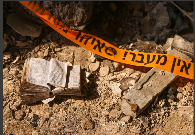
A rocket fired from the Gaza Strip by Palestinian militants hit an apartment building in the southern Israeli city of Ashkelon. October 9, 2023.